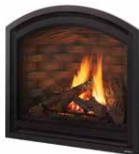
FIRESCREEN available in black, graphite and new bronze